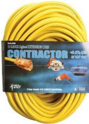
Heavy Gauge Heavy Duty Contractor Extension Cords – 2 ea 100 foot long and 2 ea 50 foot long