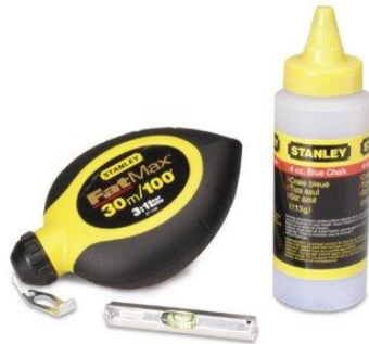
Chalk Line - Red