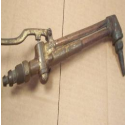
* Acetylene Gas Torch and Tanks