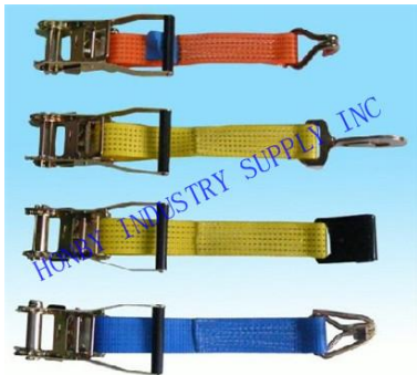
3 each 20' ratchet straps