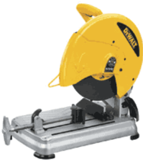
14" Chop Saw

*** Only required if you are field installing electrical chases