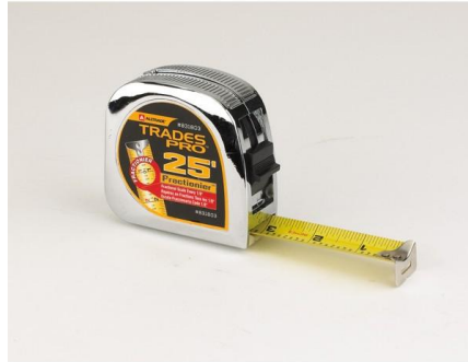
100' and 25' tape measures