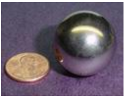
* 1" to 1 1/4" diameter Steel Balls 2 each required

*** Only required if you are field installing electrical chases