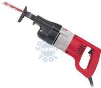
Sawzall and Blades for cement board and wood