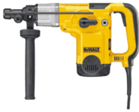
Hammer Drill for drilling into 4" concrete slab with 1 ¼" bit