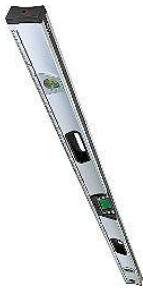
Craftsman 48" and 96" Level

The following are typical tools that should be available onsite for the installation of your kit. Most of these tools are typical tools found in most experienced carpenter tool kit. If you do not have these tools available, Innova can provide complete tool kits as an added cost and ship them along with your building kit.