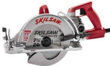
Heavy duty 7 ¼" circular saw – worm drive